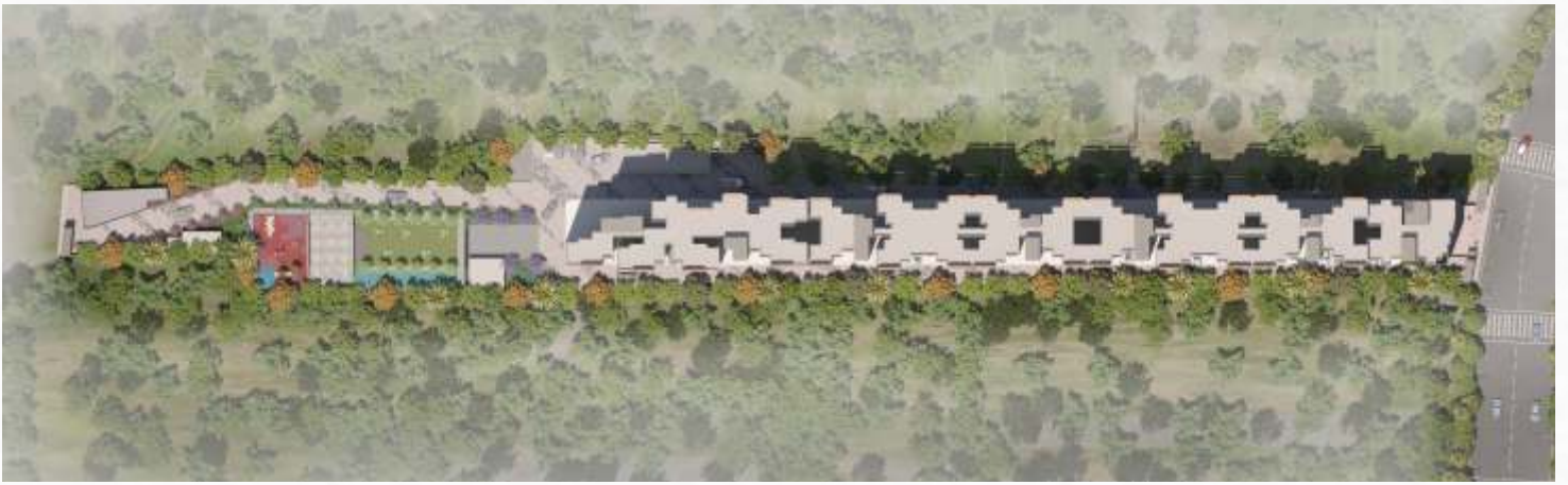
West Side Main Gate: 18m Road