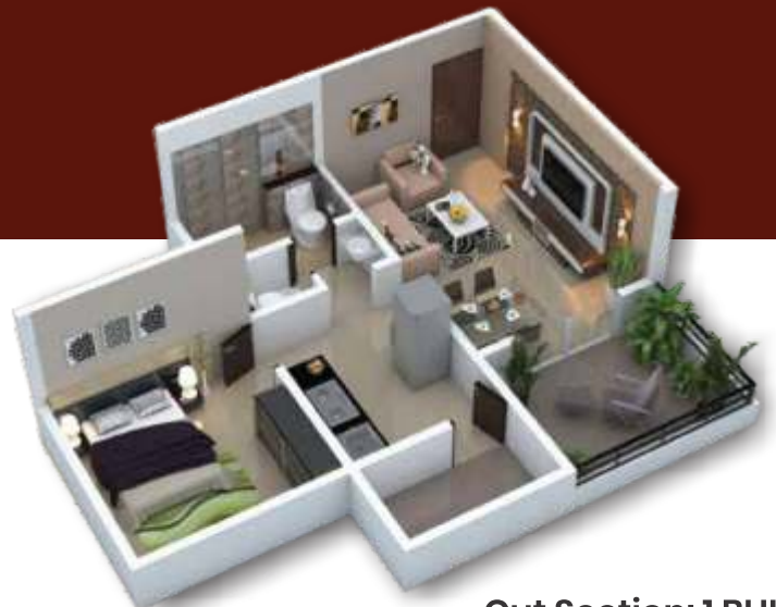
Cut Section: 1 BHK