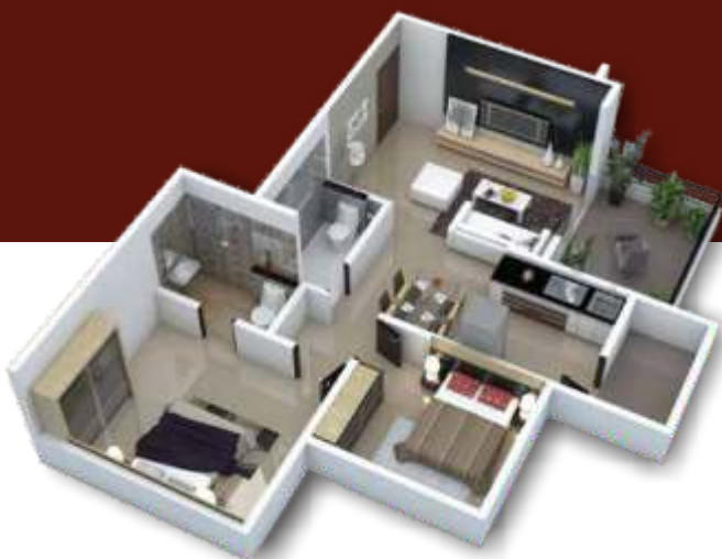
Cut Section: 2 BHK

Built by the S.B. Patil Group with an experience of 28+ years in the construction industry, God's County boasts systematic planning & sound infrastructure that helps you enjoy an unmatched standard of living, now & forever!