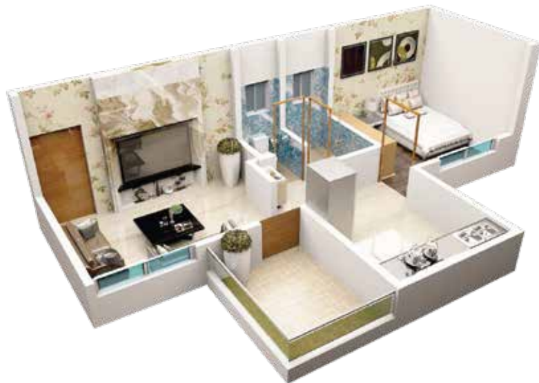
1 BHK Homes