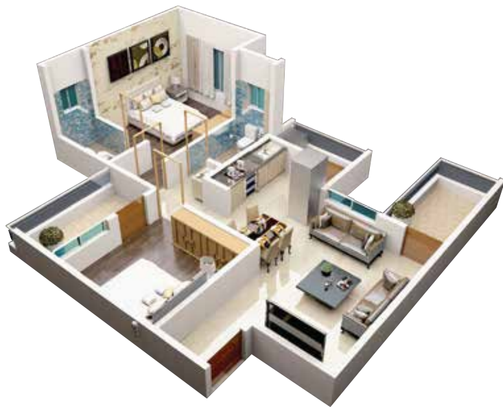
2 BHK Homes